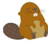
Never Give Up