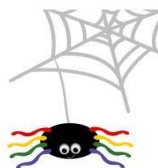
Keep on Improving