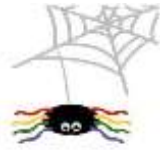
Keep on Improving