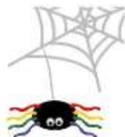
Keep on Improving