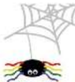
Keep on Improving