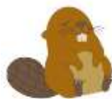
Never Give Up