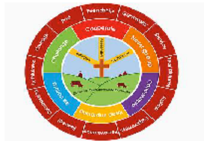
The Amberley Vision Wheel

The vision permeates through everything we do, using core Christian values and biblical teachings as vehicles for life. We use the Parable of the Sower to unite our school community in its understanding of what we hope to achieve. The story helps us to understand the elements that are needed to grow into reflective, independent and aspirational learners for life .