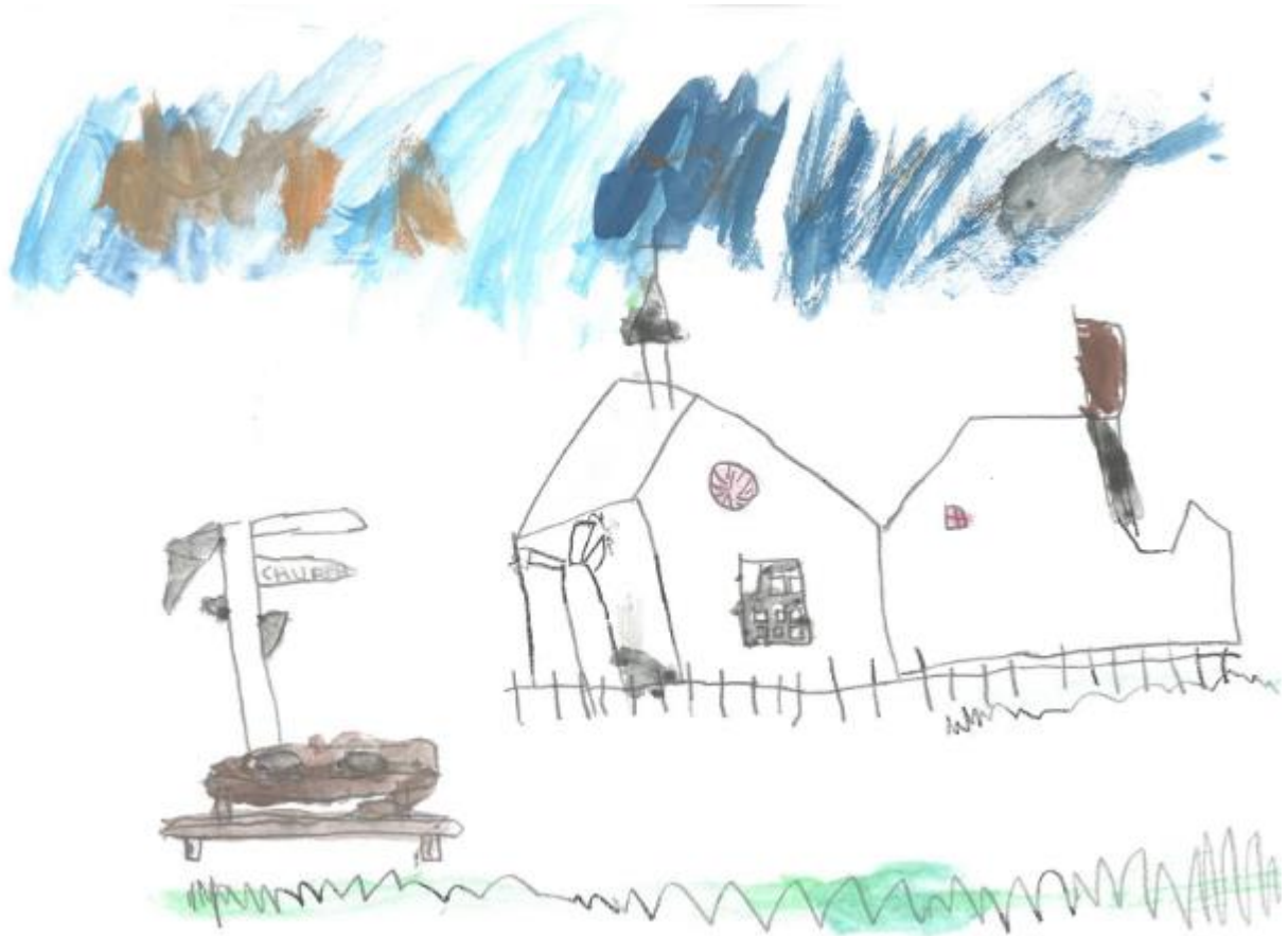
Amazing Amberley by Sadie, age 5

Providing the rich soil that enables our children to develop deep roots and flourish.