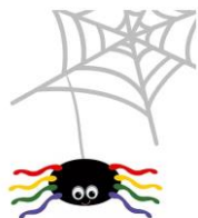
Keep on Improving