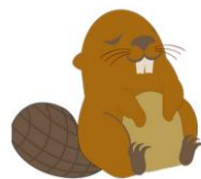
Never Give Up